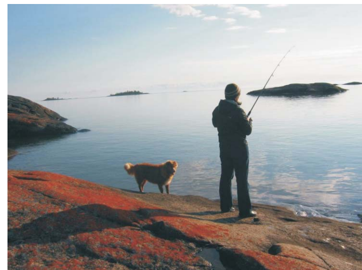
Fishing on Great Slave Lake

Make your next trip the adventure of a lifetime with Arctic Escapes Travel